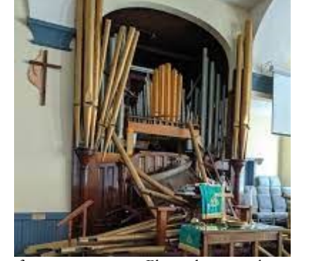
Note from management: Please do not make messes.

We are now free to make a mess of things.