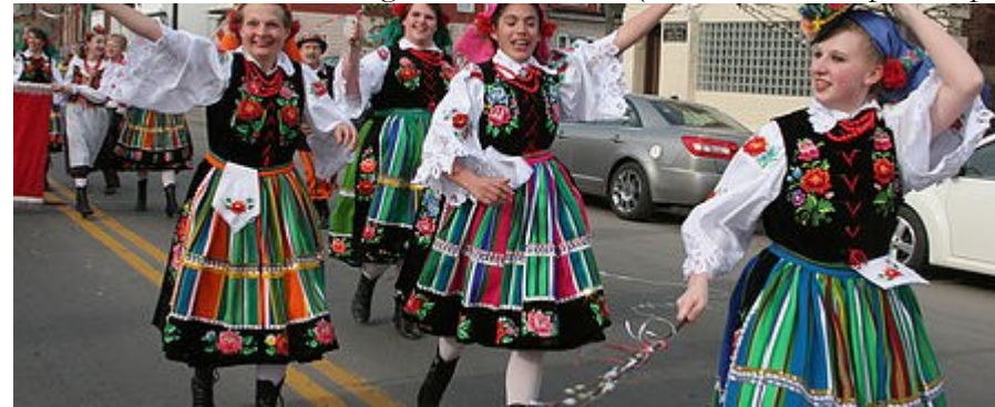
Dyngus Day parade in Buffalo, NY