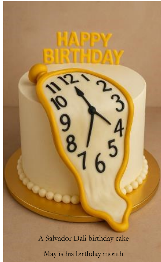
A Salvador Dali birthday cake May is his birthday month